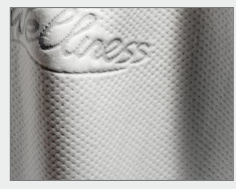
UCC572M - fabric sample

Frontpage: machine model UCC594M Subject to technical changes. Illustrations may show accessories that are not included in the standard version. Program update 10/2015