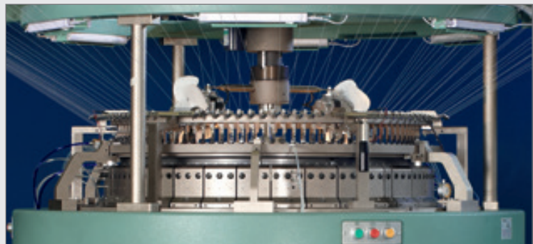
knitting head (3-feeder cam boxes)