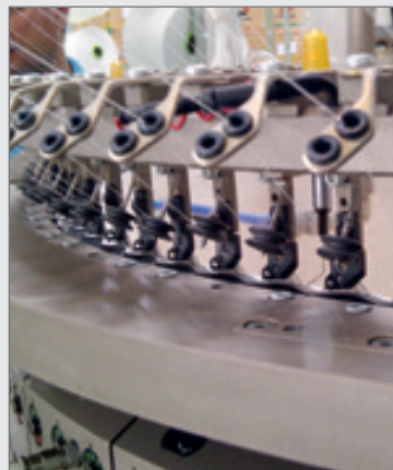
plating yarn carriers