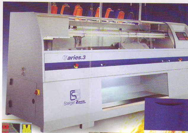
STEIGER FLAT KNITTING