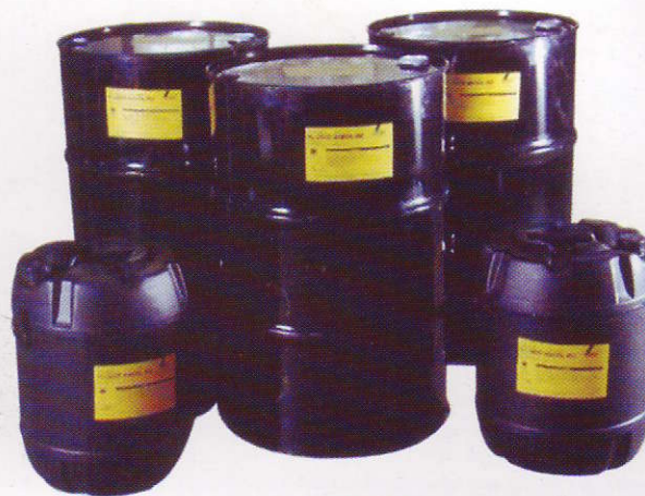
KLUBER KNITTING OIL