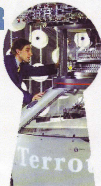
Speed and productivity are the keys to Terrot's circular knitting machine range

fabrics. An upgrade to three tracks in the dial and four tracks in cylinder camming is possible.