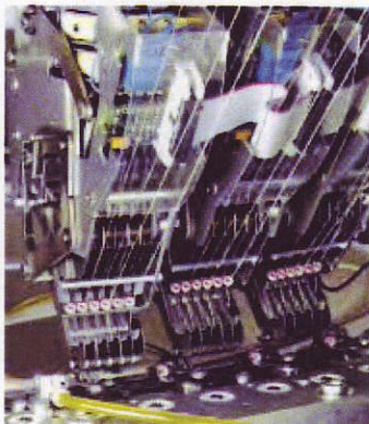
Terrot's S6F348 single knit colour striper

● I3P572 Double Knit High Production Jacquard. Terrot's traditional I3P-series has been extended to include a 72-feeder rib machine with two cams and two tracks. Running at a speed of 32rpm, it opens up new possibilities in the production of rib and interlock