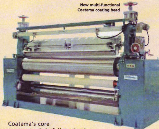
New multi-functional Coatema coating head

Coatema's core competence is in full production plants and as one example for this product division, the company is displaying a new, budget-oriented multifunctional coating head with integrated Foulard in EEx version, with a working width of two metres.