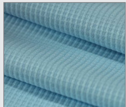
I3P354 – fabric sample