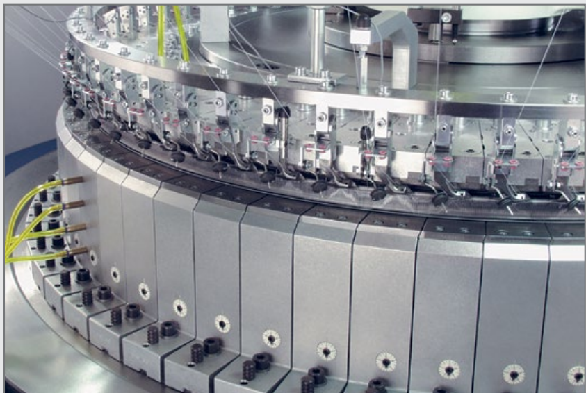
I3P354 – knitting head