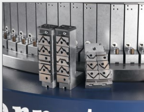
I3P572 – 3+4 cam tracks