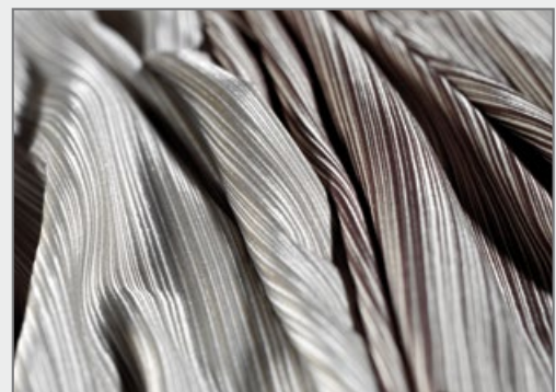
S296-1 – fabric sample