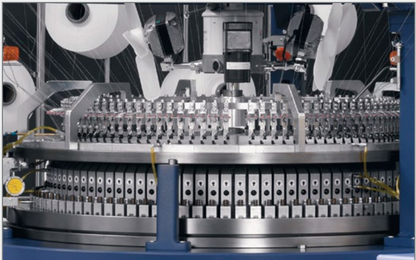
S296-2 – knitting head