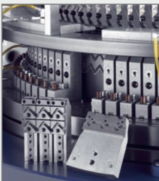
S296-2 – 2 needle tracks