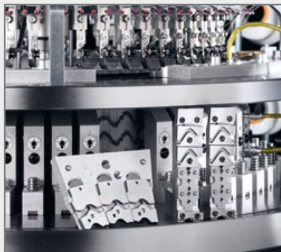
SH130 – sinker cam and cylinder cam