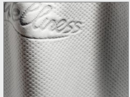
UCC572M – fabric sample