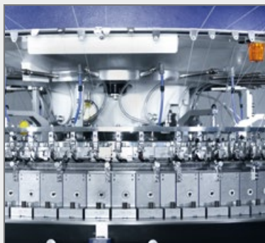
UCC548MS – knitting head