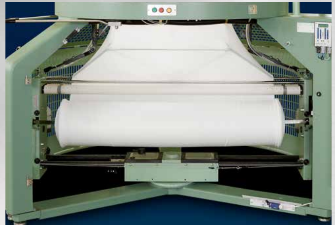
Mechanical fabric take-down