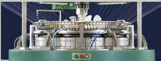
Knitting head (3-feeder cam boxes)