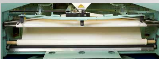
New efficient open width take-down system